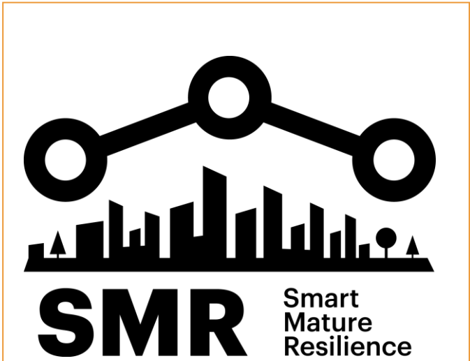
Image 7.2 Black and white logo version

The logo integrates the project's acronym SMR written in graphic bold (SMR grey) and the full name, Smart Mature Resilience, in graphic light.